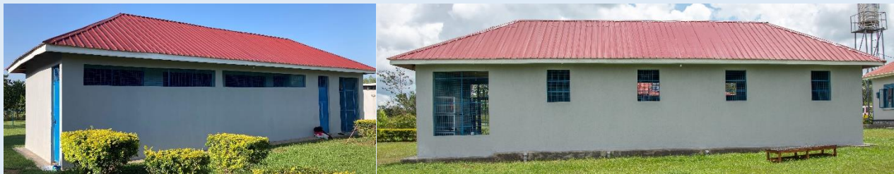
Front and back images of the reconstructed Athena kennel building.

Capital improvements during 2022 included re-construction of our original kennel building. The new Athena kennel building has five rooms for group housing of dogs and a cattery. A new closed-circuit camera system was installed to allow our doctors and security staff to monitor all patient housing areas at all times.