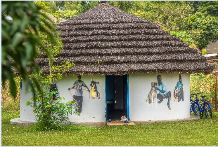
The CDP Roundhouse.