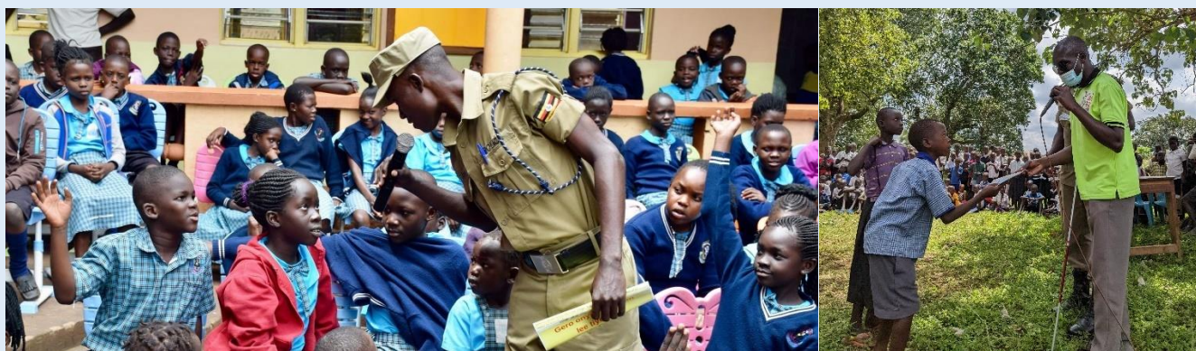
During a school visit from BIG FIX's Education Team, Lead Canine Officer for Gulu Police Department questions children (left) and copies of The Great Dog Guardian Book are given to children.

A highlight of each school visit is when the guardian and comfort dog teams provide real life demonstrations that dogs can be safe, attentive best friends. Concepts that remain unknown to many people in Northern Uganda today.