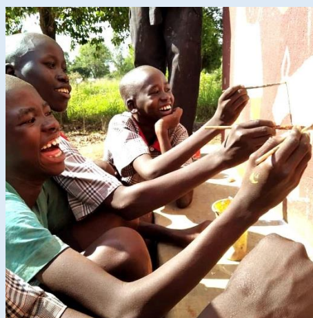
A few of the school murals created during 2022. Bottom right: students participating in the painting.

We are exceptionally grateful to The Underdog International for its generous sponsorship of our school outreach and mural painting projects during 2022.