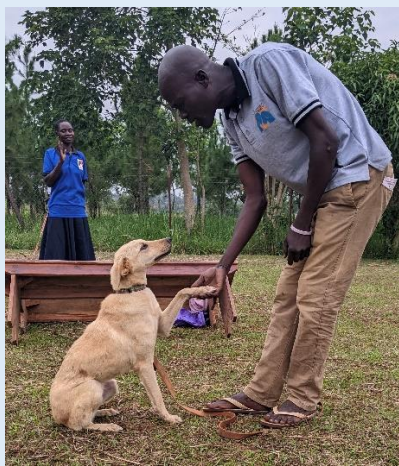
A 2022 team demonstrating “watch me” and “give paw”.

The Comfort Dog Project’s commitment to the wellbeing of our participants continues beyond graduation. Annual assessment of the psychosocial wellbeing of our graduates are conducted each year in January. Guardians are also encouraged to attend monthly guardian meetings. During 2022, we held 48 guardian meetings which included provision of free vet checks and deworming for the dogs, and training practice to reinforce dog-guardian bonding. Group counseling was provided at each of these meetings. In addition, we provided 97 individual counseling sessions during the year to CDP guardians.