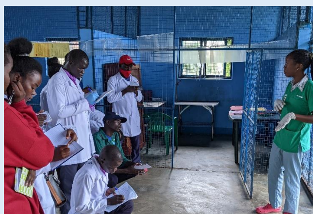
Hosting students interested in studying veterinary medicine at The BIG FIX.

The BIG FIX Uganda continued to host visits from students and interns interested in veterinary medicine. We hosted visits from a total of 243 students and their teachers from Uganda Youth Development Organization, Labora Youth Development Center, and