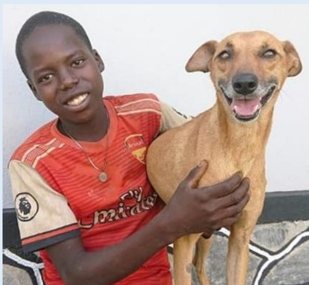
A happy guardian and his dog at the time of discharge from The BIG FIX Uganda's hospital.

This past year, we were able to hire another vet, bringing our hospital staff to 3 full-time resident veterinary doctors . We believe this greatly improved the quality of life (not to mention reducing the likelihood of burnout) for our vets, and improved the quality of care we were able to provide to each individual patient. We were also able to hire a second full time veterinary assistant.