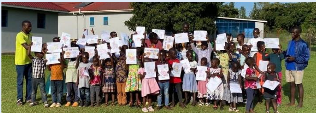
Some of the children of our staff enjoying Kids Day at The BIG FIX.

We again welcomed the children of The BIG FIX staff to come to work with their parents for Kids Day in September. It was a fun day of games, art, and having the chance to see the important work their parents do.