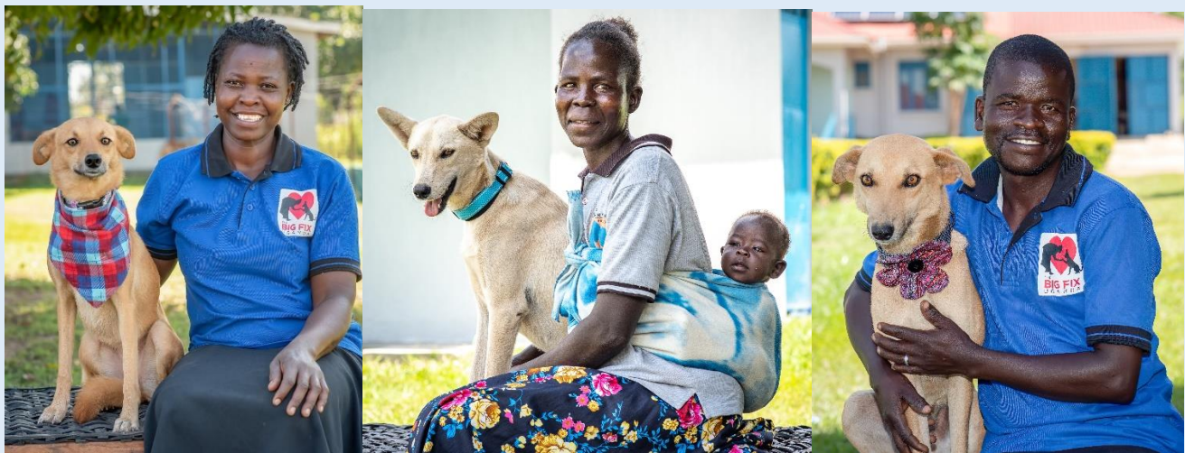
A few of the Comfort Dog Project teams.

The BIG FIX Uganda stepped into this mental health void in 2014 with the creation of The Comfort Dog Project, a canine-assisted trauma intervention. Since then, a total of 89 war trauma survivors and rescue dogs have graduated from The Comfort Dog Project. This highly effective, canine-assisted trauma intervention is the only one of its kind in Africa.