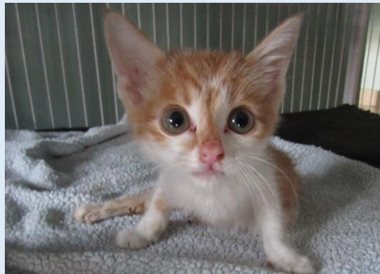
An injured kitten enjoying a safe and comfortable stay in the new cattery, part of the Athena building.