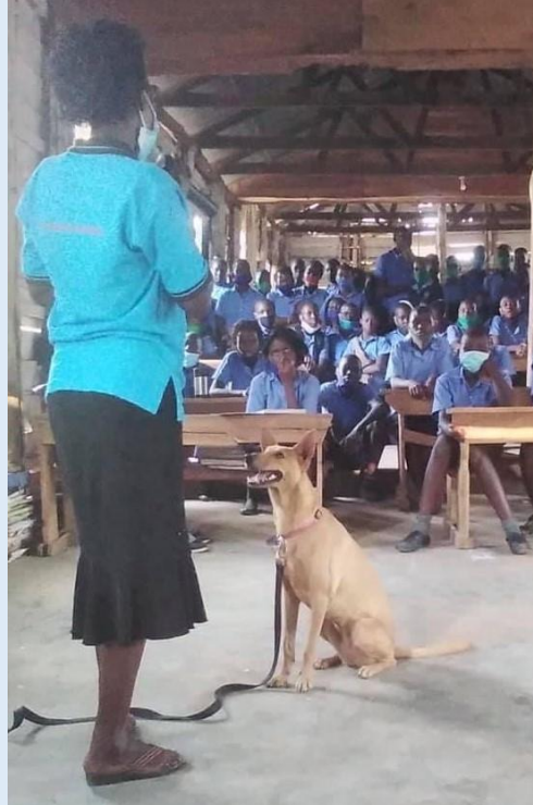
Comfort Dog Lok Oroma, a member of The BIG FIX Education Team, during a school visit.

The BIG FIX Uganda’s 2022 Education Team visited 38 schools, reaching 18,767 students and their teachers. Our Education Team included BIG FIX’s Education Manager, the Principle Education Officer for Gulu City, the Lead Canine Officer for Gulu Police Department, and 3 very impressive Comfort Dog Project teams.