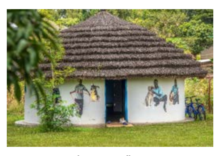
The CDP Roundhouse