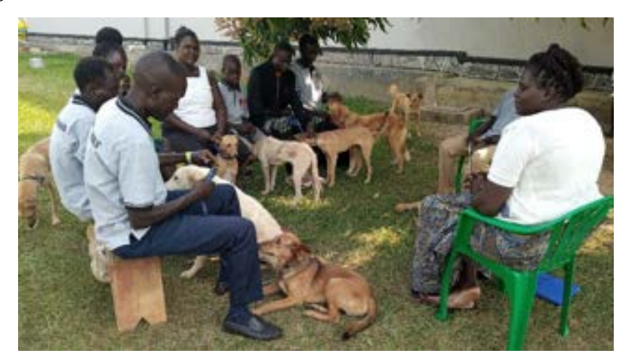
Group counseling session during one of the guardian meetings , 2023

We maintained an emergency food bank for guardians who needed support to provide adequate food to their dogs and themselves.