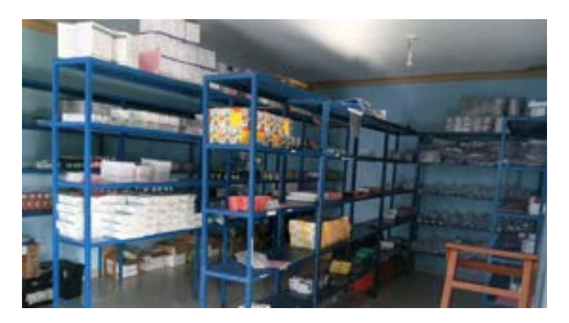
The new pharmacy interior

An annex to our hospital was constructed which now houses our pharmacy. The addition of the pharmacy annex has allowed us to greatly improve our hospital inventory control and has alleviated the shortage of space within the hospital building. The floors of the pharmacy are tiled and we installed metal shelving units to house the drugs and supplies needed to operate the hospital. Our pharmaceutical refrigerator was moved to the pharmacy as well.