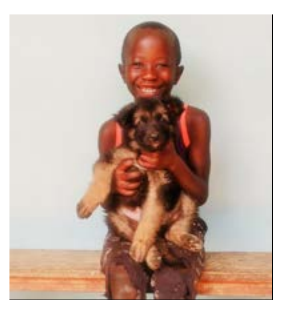
A happy guardian and his dog at the time of discharge from The BIG FIX Uganda's hospital.

We asked people to pay for services at the hospital based on their ability to pay. While this generated income of 70,000,000 Uganda shillings (about $19,300 USD) during 2023, many guardians could not afford to pay and we provided services free of charge.